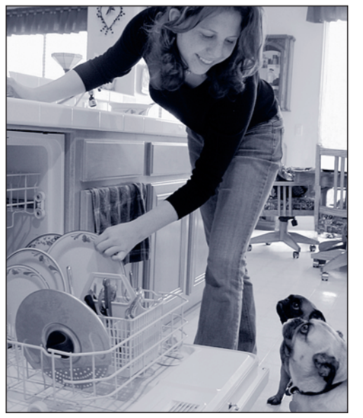
More than eighty percent of respondents said they run only full-loads in the dishwashers and washing machines.

The vast majority of our customers who completed the survey said they are practicing water conservation. More than eighty percent of respon- percent reported that they sweep the