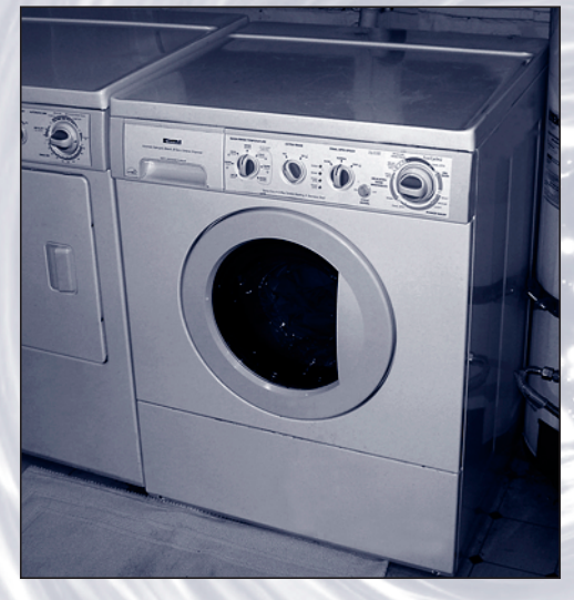
The program's objective is to distribute rebates for watersaving appliances and equipment for our customers, such as this high efficiency washing machine.

The One-Stop Water Conservation Rebate Program is co-funded through a grant from Proposition 50 and participating water suppliers throughout California. The California Urban Water Conservation Council is sponsoring this program. Program includes a wide-ranging list of measures to maximize economies of scale and marketing power to achieve a high volume of savings. The Program's objective is to distribute rebates for water-saving appliances and equipment for our customers. This will improve water-use efficiency throughout the Ventura Watershed.