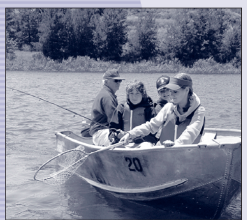
For more information visit our Web site www. lakecasitas.info