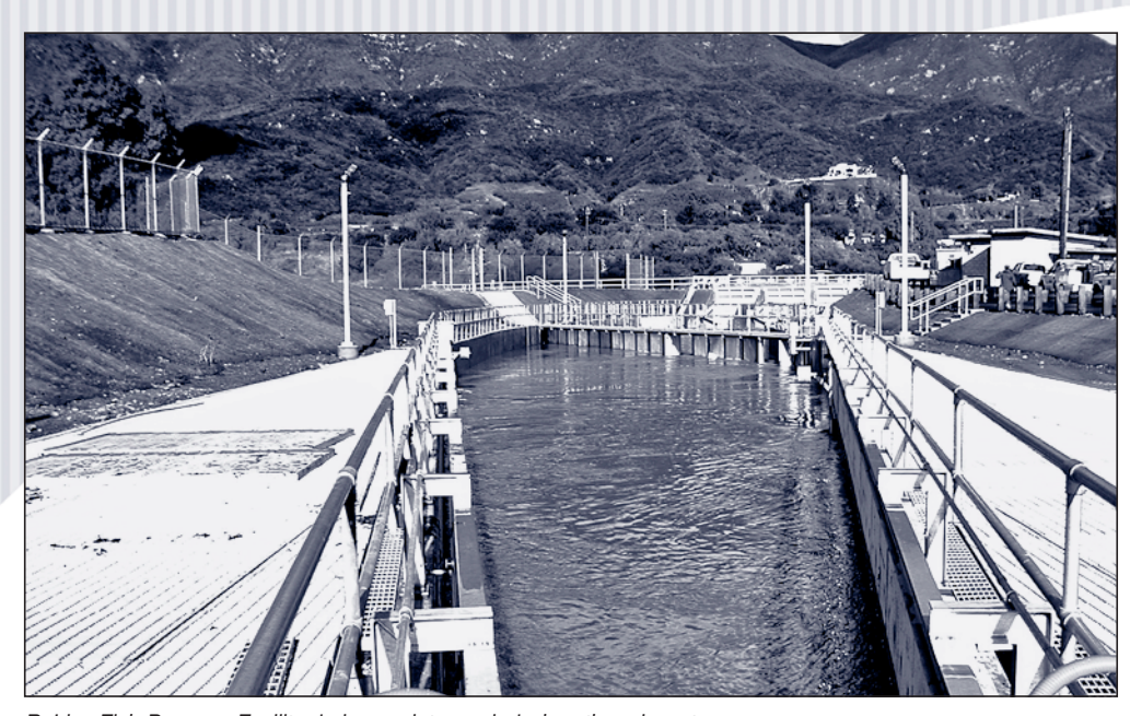
Robles Fish Passage Facility during a winter period when there is water.